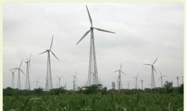
Clean Energy of 12 MW capacity generated by JKM Wind Farm at Coimbatore - a step towards achievement of zero carbon footprint.