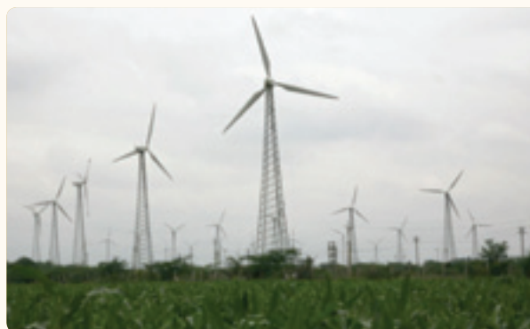
Clean Energy of 12 MW capacity generated by JKM Wind Farm at Coimbatore - a step towards achievement of zero carbon footprint.