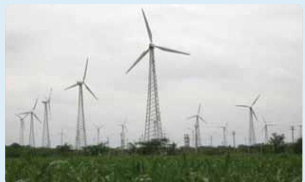
Clean Energy of 12 MW capacity generated by JKM Wind Farm at Coimbatore - a step towards achievement of zero carbon footprint.